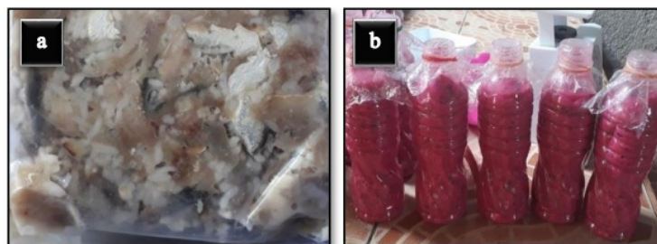
Figure 1. Chao teri product: a) Chao teri before dyeing, b) Chao teri after dyeing.

Chao Teri was purchased from the local market in Labakkang, Pangkep Regency in South Sulawesi, Indonesia (Fig.1). Making chao teri in traditional processing begins with the cleaning of fresh anchovy, which includes head separation and washing. Furthermore, the washed anchovy is sprinkled with salt as much as 20-25%, then fermented in a closed container for a week (first fermentation). After the salt fermentation process is complete, anchovy is rewashed, drained for other added rice as a carbohydrates source as much as 20% and 1% yeast. This mixture is stirred evenly and put in a closed container again for 1 to 2 weeks (second fermentation).