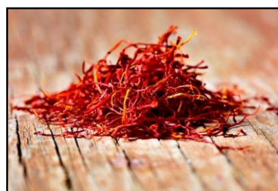
Figure 1. Safflower ( Carthamus tinctorius L )

Dried Safflower (Fig. 1) were purchased from the local market and stored at room temperature until use. Gallic acid monohydrate, sodium carbonate, quercetin, Folin Ciocalteu's phenol reagent, potassium acetate, and 1,1-diphenyl-2-picrylhydrazyl-hydrate (DPPH) were all purchased from Sigma-Aldrich (Singapore). Propanol were purchased from Merck (Singapore). Most of the chemicals are used analytical grade and were used and without purification.