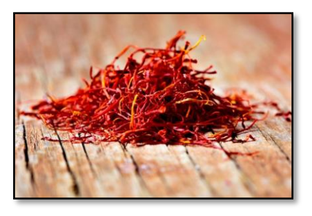
Figure 1. Safflower (Carthamus tinctorius L)

Dried Safflower (Fig. 1) were purchased from the local market and stored at room temperature until use. Gallic acid monohydrate, sodium carbonate, quercetin, Folin Ciocalteau's phenol reagent, potassium acetate, and 1,1-diphenyl-2-picrylhydrazyl-hydrate (DPPH) were all purchased from Sigma-Aldrich (Singapore). Propanol were purchased from Merck (Singapore). Most of the chemicals are used analytical grade and were used and without purification.