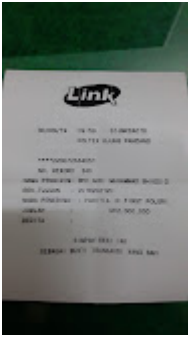
BUKTI TRANSFER.jpeg 49K