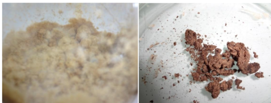
a). before delignification