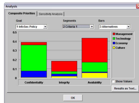
Figure 3. Composite Overall Priorities

The following figure shows the graph of composite overall priorities in Web-HIPRE.