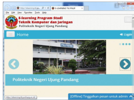
Fig. 2 Moodle as LMS Platform

Considering its many advantages and requirements from faculty members, a new initiative to apply LMS was started in our institution in 2007. Moodle was chosen considering its wide user and active community in the world as well as in Indonesia .