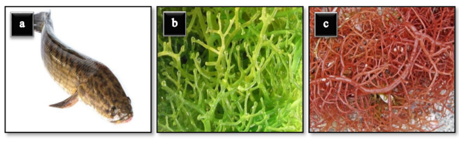
Figure 1. Main ingredient nori snack. a) Snakehead, b) Eucheuma cottonii; and c) Gracilaria sp.