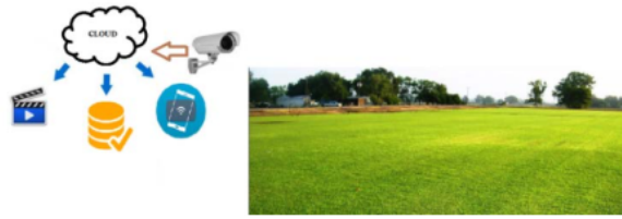
Fig. 2 Cloud based grass surveillance systems.

Previous studies have shown several video streaming techniques that currently well developed and maintained both in laboratory environment as well as in real implementations that might be taken into consideration [13][14]. In choosing a specific video streaming technology, it is important to take many considerations, looking at from different angles and use various criteria in order to minimize possible risks and at the same time to maximize benefits of the project in the future.