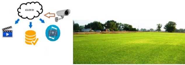
Fig. 2 Cloud based grass surveillance systems.

Previous studies have shown several video streaming techniques that currently well developed and maintained both in laboratory environment as well as in real implementations that might be taken into consideration [13][14]. In choosing a specific video streaming technology, it is important to take many considerations, looking at from different angles and use various criteria in order to minimize possible risks and at the same time to maximize benefits of the project in the future.