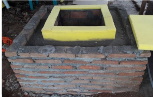
Figure 1. ZECC was placed on the surface