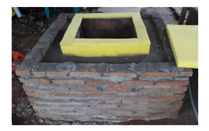
Figure 1. ZECC was placed on the surface